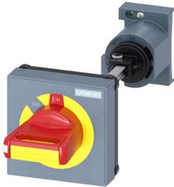
door-coupling rotary operating mechanism EMERGENCY OFF, size S00...S3 130 mm shaft